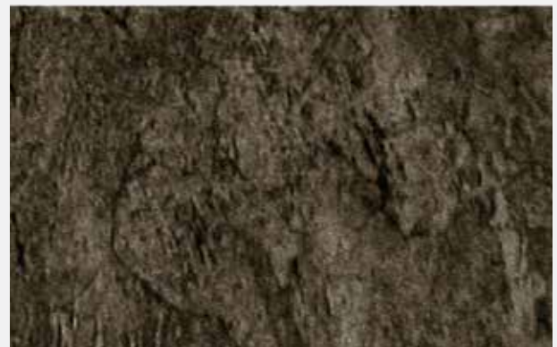
Luvata's CuCrZr fine grain structure

Luvata Ohio Inc. 1376 Pittsburgh Drive Delaware Ohio 43015 USA Tel: +1 740 363 1981