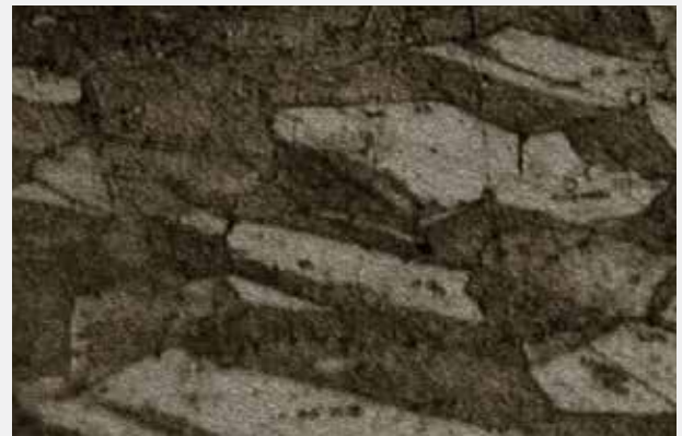
Conventional CuCrZr grain structure